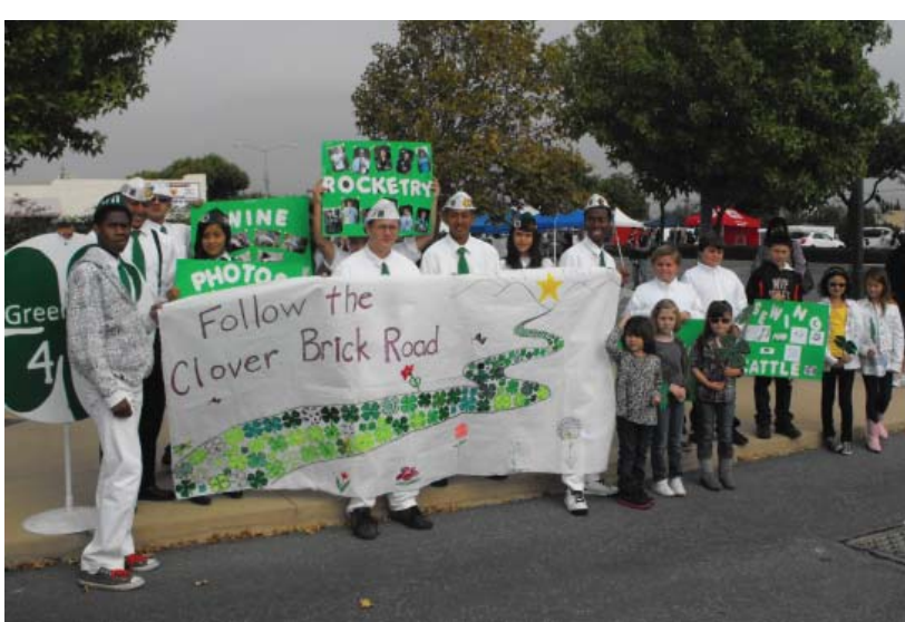
Greenfield 4-H members who participated in the parade