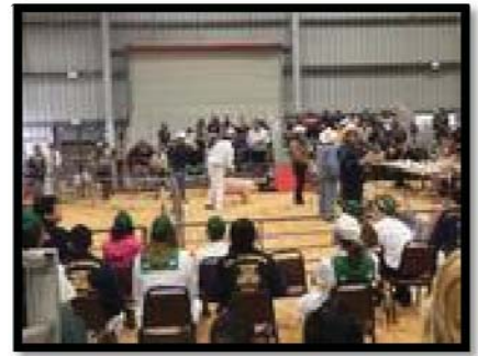
Action Swine photo shoot