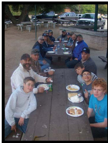
The boys, dads & grandpas