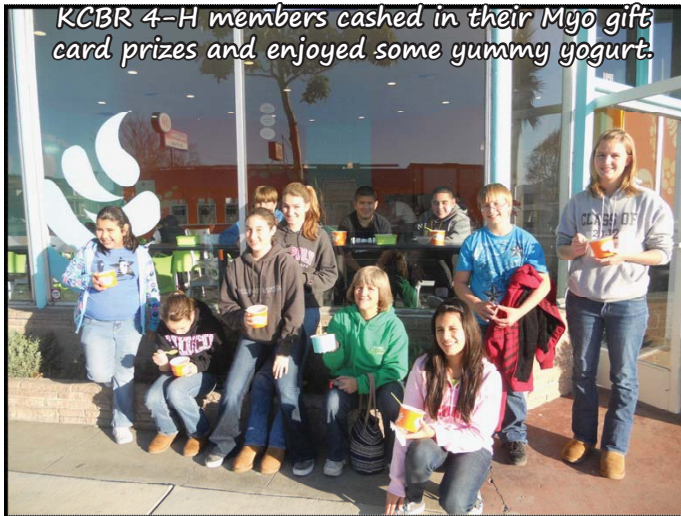
KCBR 4-H members cashed in their Mygo gift card prizes and enjoyed some yummy yogurt.

Everyone had lots of fun and we hope more members join us next year. Special thanks to Valley Center Bowl for accomodating us and giving us free bowling cards that were used as prizes and to the 4-H Council for covering the cost for this event.