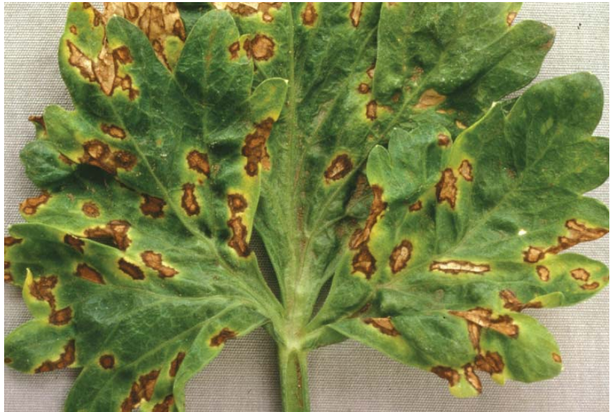
Bacterial blight of celery