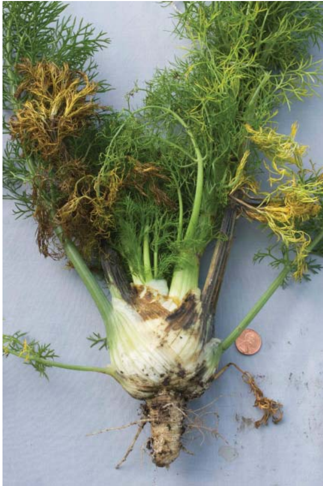
Bacterial streak of fennel