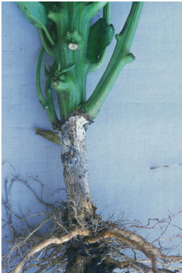
Sclerotinia infecting the crown tissue of pepper.