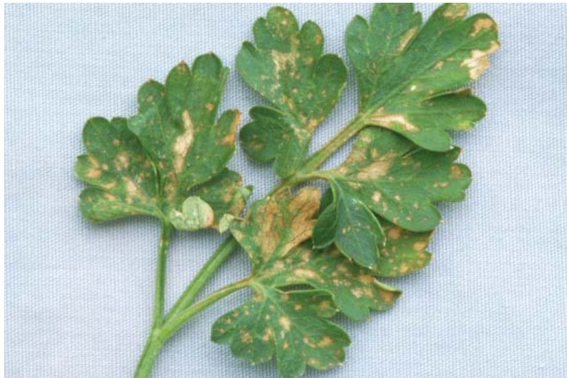
Bacterial leaf spot of parsley