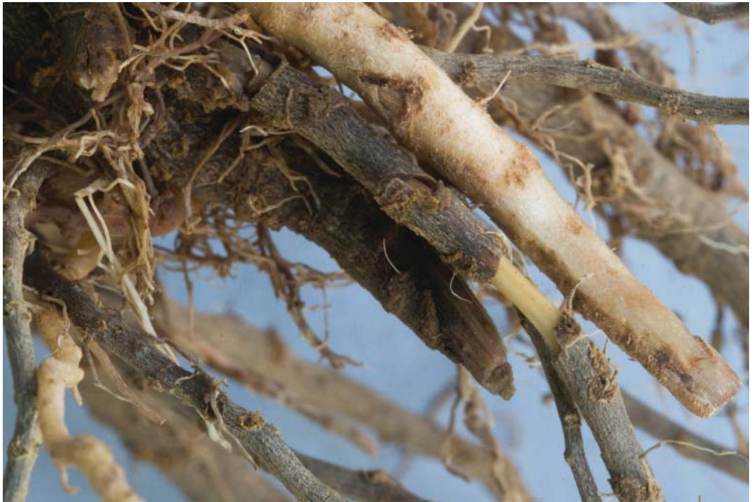
Healthy and diseased roots of plant infected with Phytophthora.