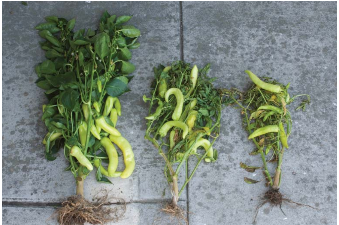
Southern blight crown infections cause plants to be severely stunted and wilted (healthy plant is on the left).