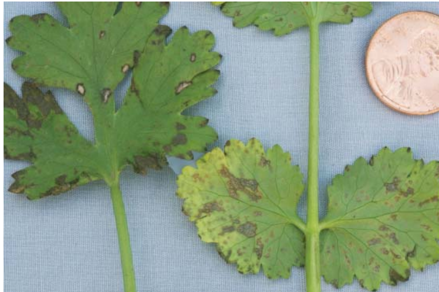
Bacterial leaf spot of cilantro