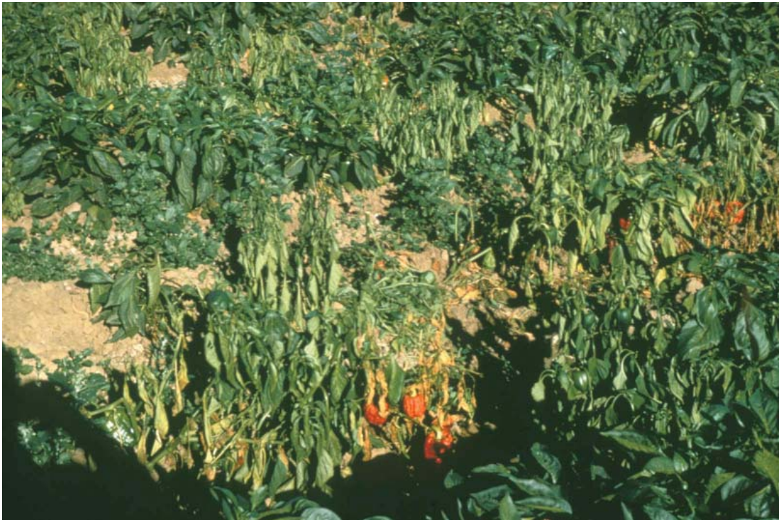
Wilted pepper plants infected with Phytophthora.

Managing soilborne diseases of pepper: (1) The first step in managing these problems is to accurately identify which disease is affecting the crop. Histories of previous problems will be useful in diagnosing the current problem. Experienced personnel will be able to identify southern blight and white mold in the field; other diseases will require laboratory testing. Samples can be sent to the UCCE diagnostic lab in Salinas for analysis. (2) If possible, plant peppers in fields having no history of these problems. Alternatively, if fields are known to harbor these pathogens, then rotation to a non-host crop is advisable. (3) Pre-plant fumigation can effectively reduce soilborne pathogen inoculum. However, such a practice is very costly and available fumigants are dwindling. (4) Resistant pepper cultivars are the best means of managing these soilborne issues. However, acceptable pepper types having resistance traits are not yet available for coastal California growers. (5) Properly prepared beds that drain well can perhaps reduce disease severity, especially with Phytophthora root and crown rot. This disease is also managed with careful irrigation and avoiding over-watering. (6) Very critically, cultivation practices and movement of farm equipment should avoid, as much as possible, the spread of contaminated soil because all these pathogens reside in the soil; transport of infested dirt and mud on equipment will spread the fungi to clean fields.