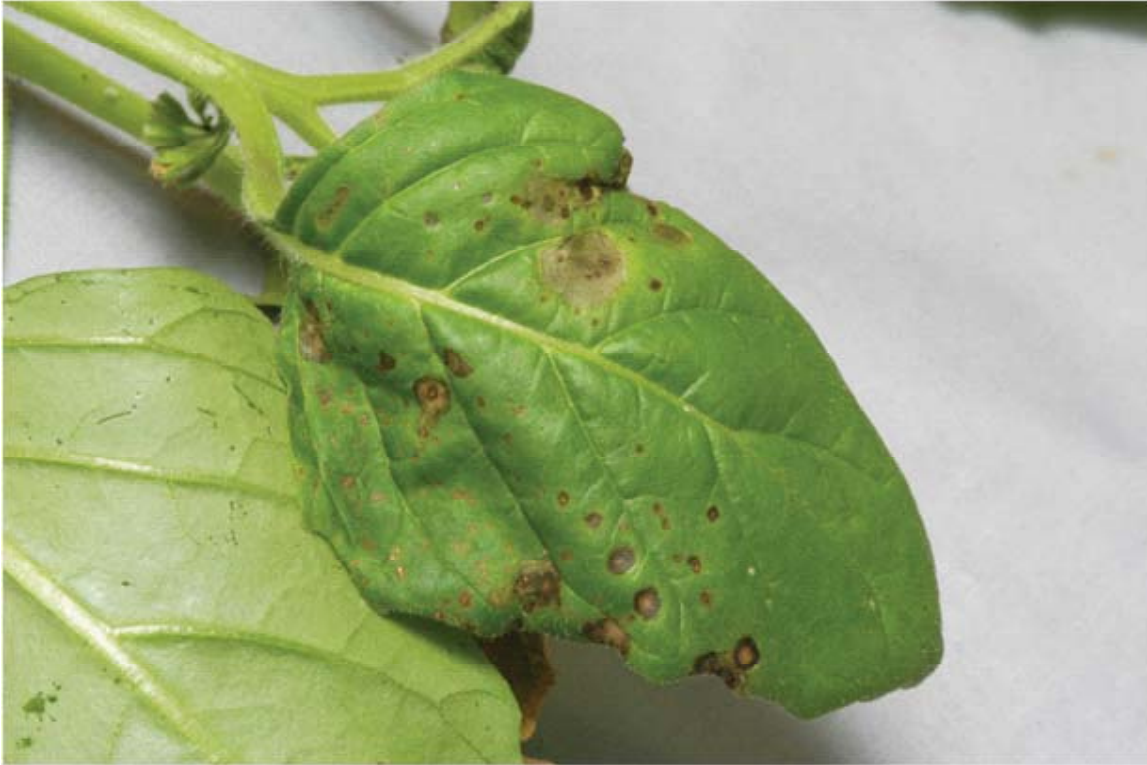
Table 1. Weeds, collected from lettuce growing areas in the Salinas Valley, that tested positive for Impatiens necrotic spot virus

Figure 5. Only a few weed species, such as nightshade, showed symptoms caused by INSV.